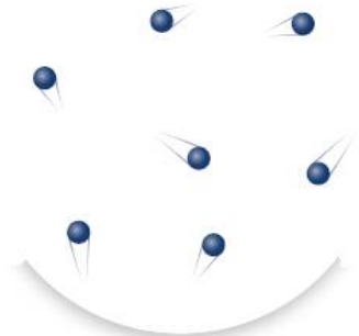
Particles in a _____